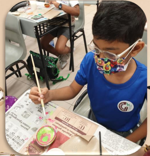
Painting of clay oil lamps