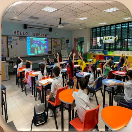
Theatre experience on Nursery Rhyme