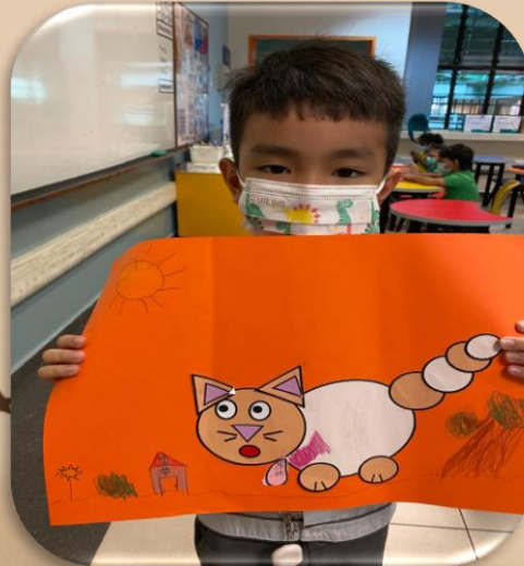
Learning shapes through animal song