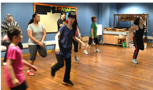
Photo: One of our Aerobics sessions

With the primary aim of promoting healthy lifestyle and bonding between the children and their parents, aerobics classes are organized on every Saturday morning 9.00am to 10.30am. wef 23 Feb 2013.