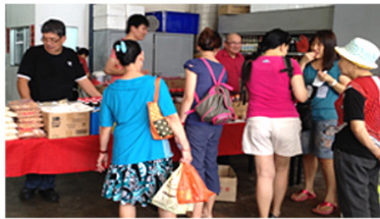
Photo: Our parents are busy shopping and food tasting for CNY at Woodlands Loop!

Our parents were engrossed in shopping and food tasting for their CNY goodies at various food outlets that we had planned for the trip.