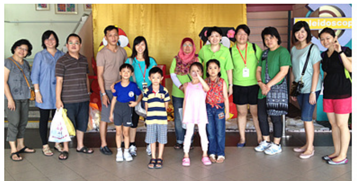
Photo: Participants of the CNY—One photo before we head off for the trip!

Companies like Fassler, ZAC, Old Chang Kee, and many more were found there.